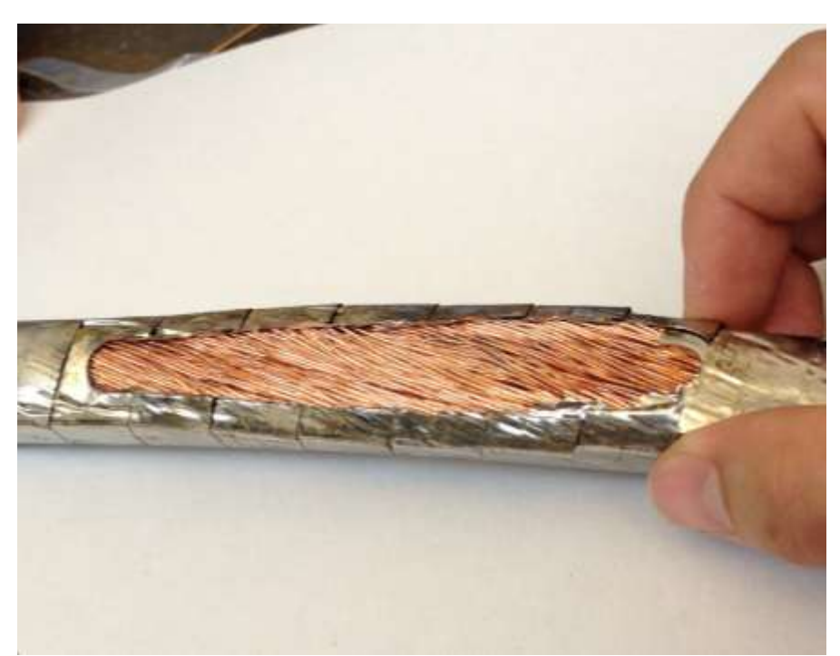
Figure 12 NbTi and copper strands underlying the He inlet insert after the destructive examination of the sample to perform measurements of the strand degradation.

In particular, the degradation will be evaluated by comparing the electrical properties of pieces of the same strand in the virgin state with pieces extracted from the thermal affected zone and with pieces subjected to a controlled heating up to 500 °C for 30 s.