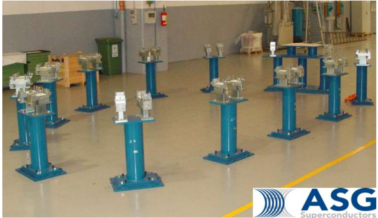
Figure 4 DP manufacture bench

In the manufacture process after winding two important steps are foreseen to wrap the insulating tape around the DP and the stacking and final insulation of the WP respectively. Figures 4 and 5 show the DP and WP benches already available at ASG premises. Note that both benches are equipped with special tooling for the adjustment of the dimensions before the final insertion of the winding in the casing structure.