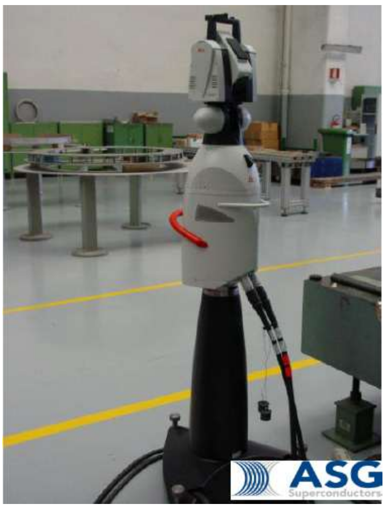
Figure 8 Laser tracker for dimensional survey.