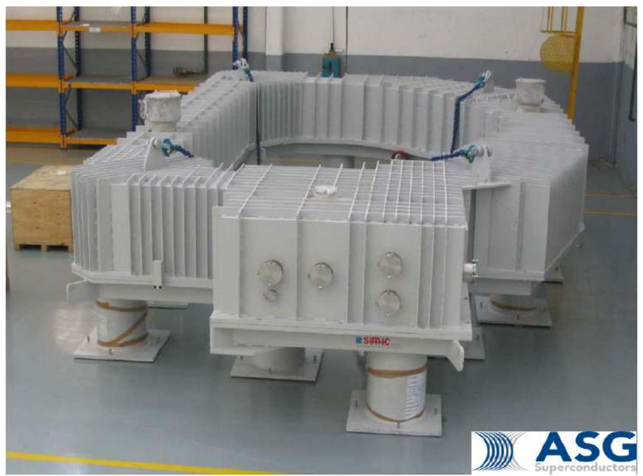
Figure 9 Vacuum chamber to perform final test on coil.