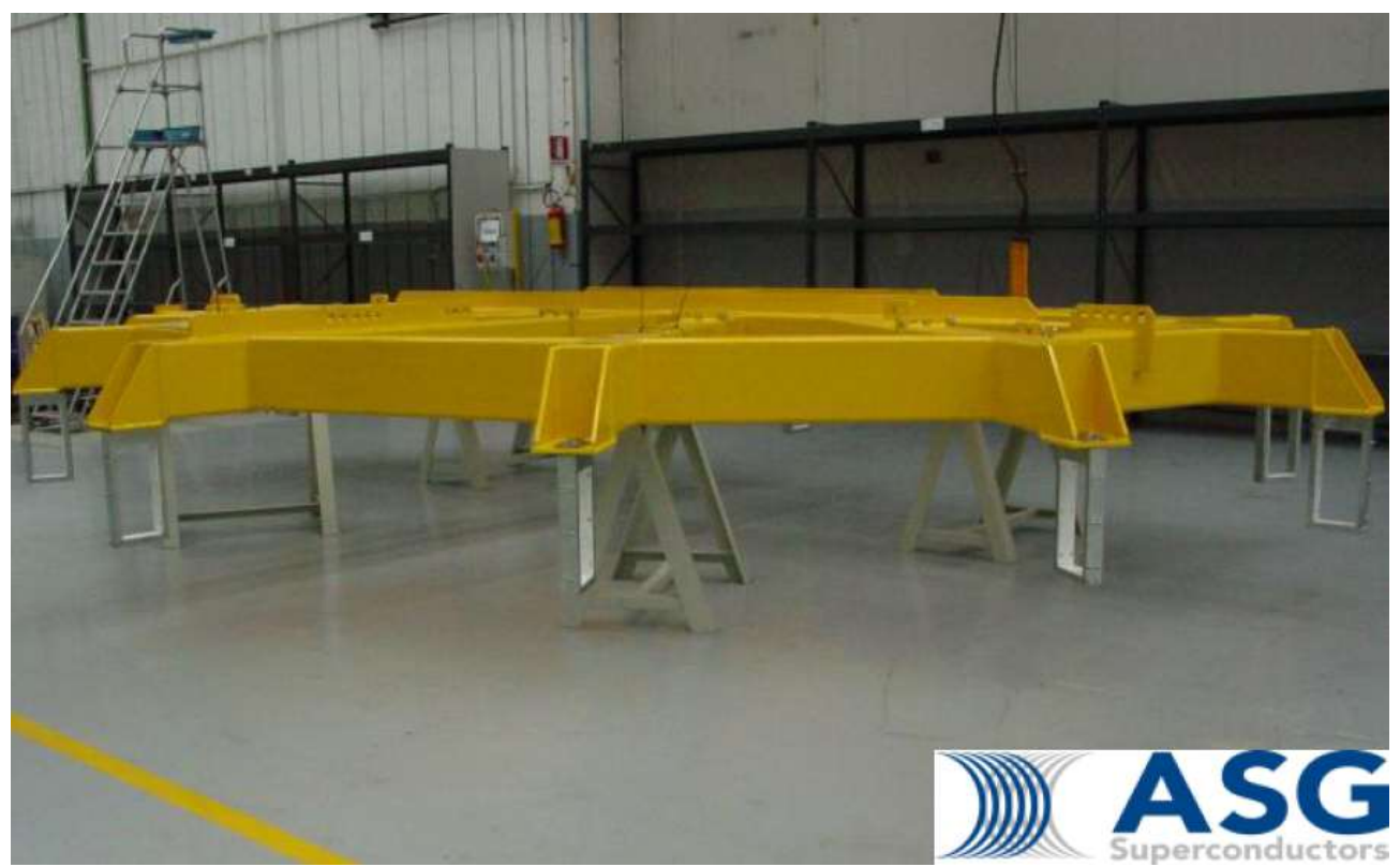
Figure 3 Lifting tool for DPs and WP