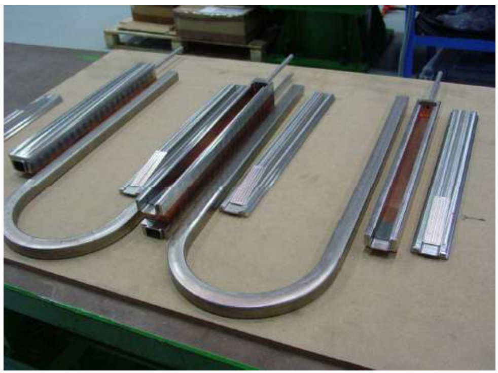
Figure 14. Terminations and inner joint sample preparation.

Although superconducting, the TF coil will experience some electrical resistivity in the internal joint connecting the adjacent pancakes and between one coil and another (or the feeders) through the terminations.