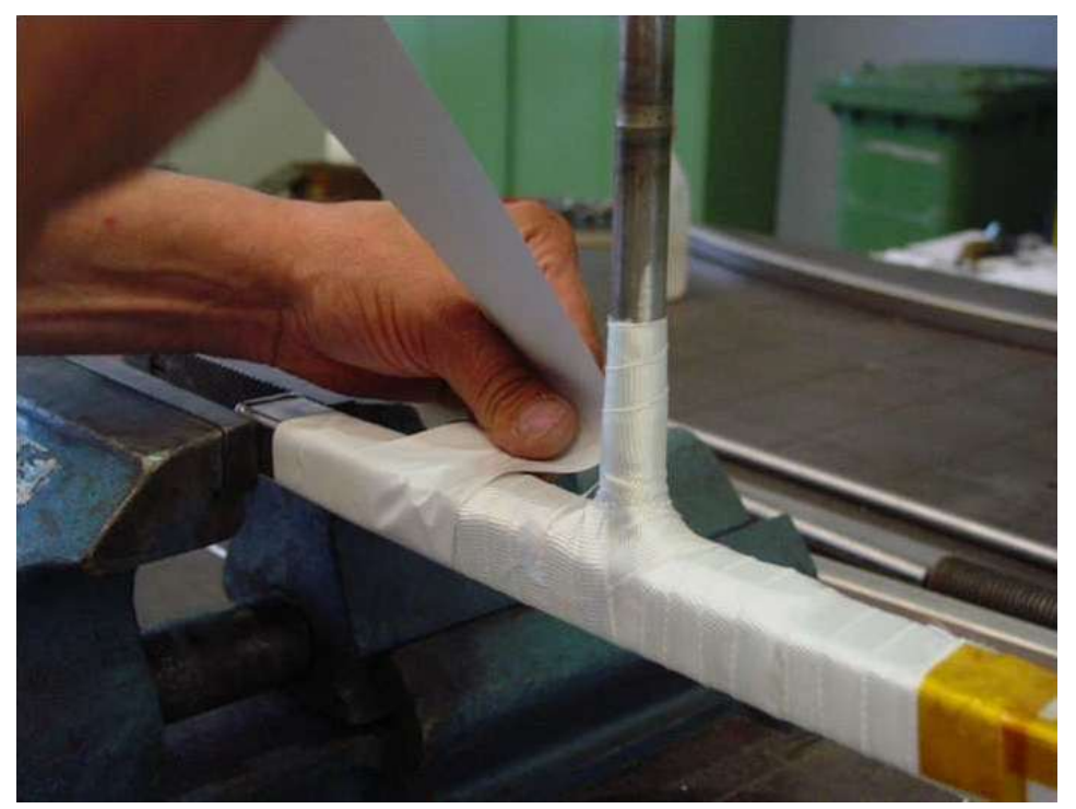
Figure 13 He inlet insert covered by glass tape to perform the insulation and the related electrical tests.

The He insert has been qualified for the electrical insulation properties. After the application of glass tape, the specimen has been impregnated with epoxy resin and subjected to voltage up to 5kV without any electrical discharge at room temperature.