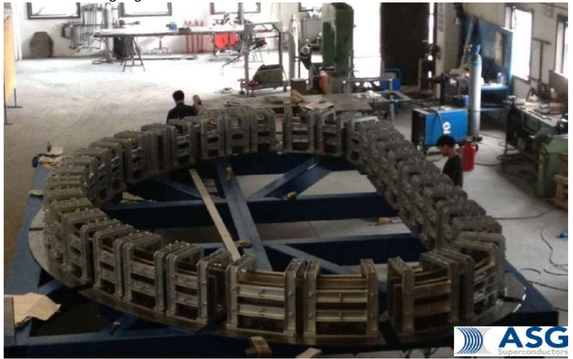
Figure 6 Impregnation mould during final tests before installation in Genoa.

After winding and stacking 6 DPs to form a complete WP, the coil will be inserted in an impregnation mould where, after verification of the correct geometry, it will be impregnated. The impregnation is a Vacuum Pressure Impregnated process (VPI) therefore the mould is capable to apply a pressure on the WP and is equipped with a heating system to apply the curing cycle needed to the epoxy resin to gelify. Figure 6 shows the mould undergoing to the final tests before installation in Genoa.