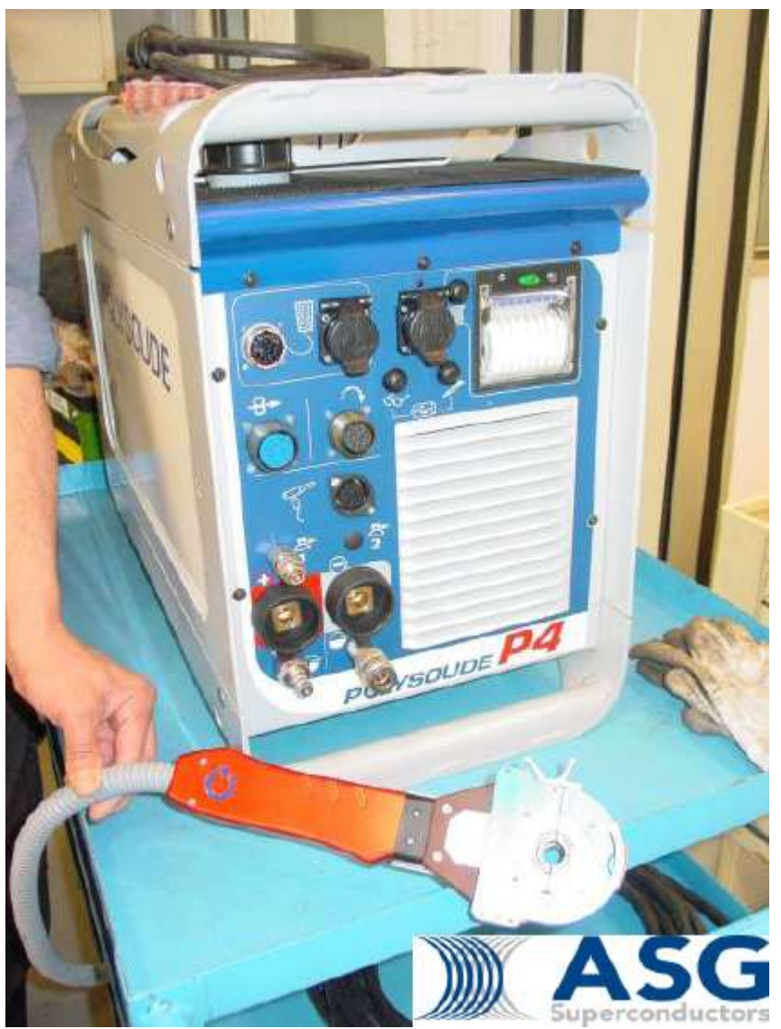
Figure 7 Orbital welding machine for He piping welding.

One of the last operation of the coil manufacture is the application of the He piping system. This process will be carried out by using an orbital welding machine completely automated for a perfect reproduction of each weld. Figure 7 shows the orbital welding already at ASG premises where it has been successfully tested.