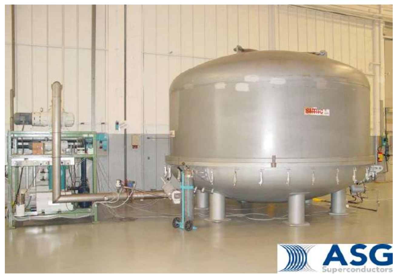
Figure 1 Vacuum chamber and pumping system for acceptance tests on spooled conductors.

As already recalled in the list of steps foreseen during the manufacture of each coil, the manufacturer has to perform some tests on the conductor before winding. The tests foreseen include pressure tests at 30 bar and leak test up to 10^{-8} mbar*l/s. Both these tests must be performed within a vacuum chamber to guarantee a vacuum of 10^{-4} mbar. Figure 1 shows the vacuum chamber already installed at ASG premises and the associated pump system. The chamber has been already commissioned in September 2012 on a conductor unit length (UL) 240 m long intended to commission the winding line.