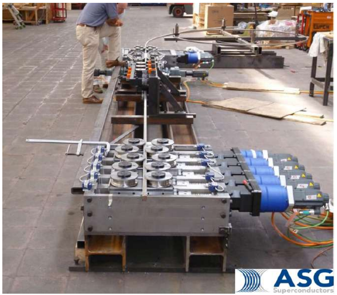
Figure 2 Straightening and bending tools of the winding line during final test before installation in ASG premises.

The winding line is composed of many other parts not shown but already available at ASG. These parts are the cleaning and sandblasting device needed to reach a proper level of roughness on the surface on the conductor jacket to guarantee a proper level of adhesion to the insulation. Also a wrapping tool is present to wrap the glass tape around the jacket. Once bent the conductor is kept in contact with a D-shaped tool having exactly the nominal dimensions of the inner side of the coil to guarantee to respect of the tolerances fixed at the design level. It is worth noting that the winding line is controlled by an automatic system capable to give the defined shape by assigning the geometrical features.